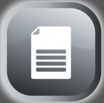
FAST TRACK SUBMITTAL PACKAGE