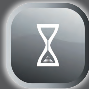
7 DAY INSTALLATION