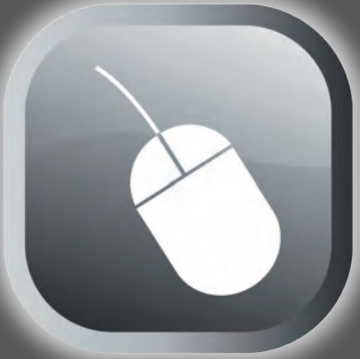
INSTANT ORDERING AND PRICING